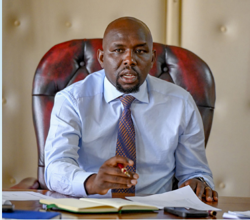
Cabinet Secretary of the Ministry of Roads and Transport, Kipchumba Murkomen, EGH,

between peak and off-peak demand in Kenya on a normal day is about 1000 MW. To maintain system stability, power generation is generally curtailed during these off-peak periods. According to the Energy and Petroleum Regulatory Authority (EPRA) statistics, a total of 495,437 MWh of energy was curtailed between July 2022 and June 2023. This is an average daily curtailment of over 1357 MWh. This is a lot of energy that could be used to create demand at night. E-mobility can help bridge this gap by charging EVs, especially at night. On average, a 51-seater bus has a battery capacity of 180-200 kWh to give a 200 km range. The daily curtailed energy can therefore put about 7,000 electric buses or over 200,000 electric motorcycles on the road.