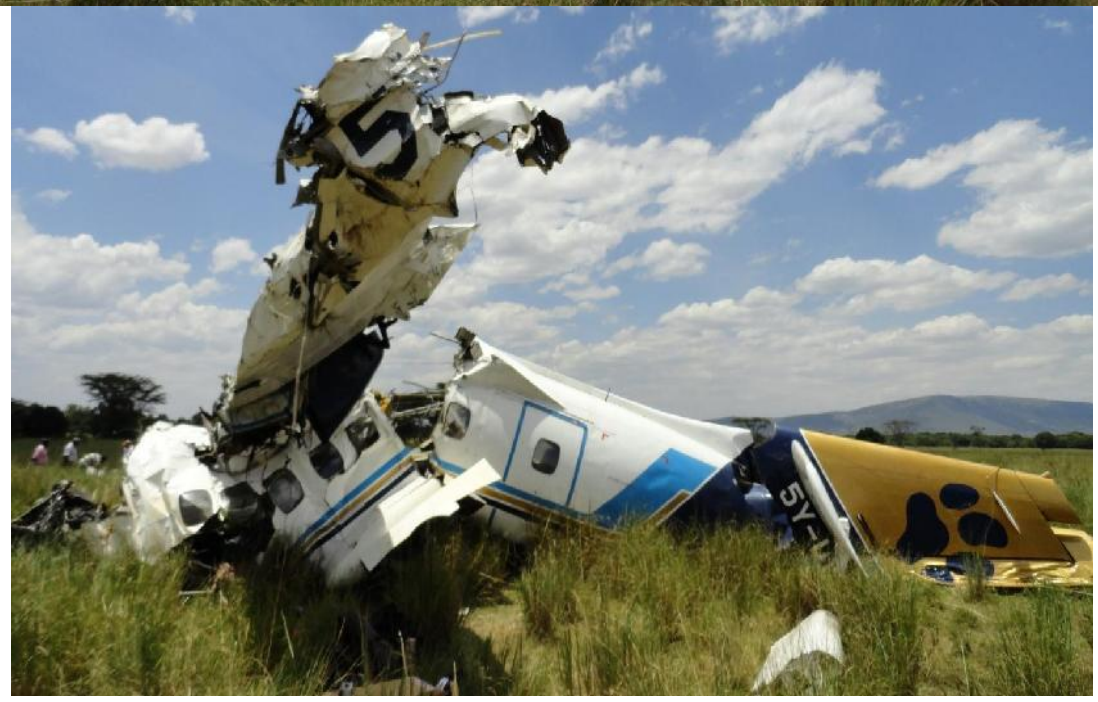
figure 1.1 accident site with the wreckage of 5Y-UVP